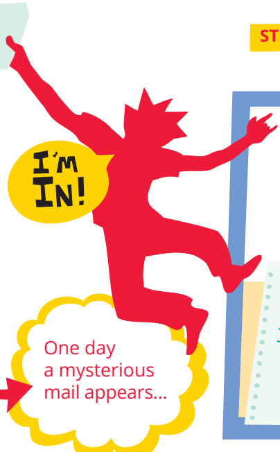
STEP 4. PRE-DEPARTURE ARRANGEMENTS