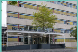
Hans Freudenthal building (HFG)