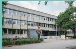
Leonard S. Ornstein building (OL)