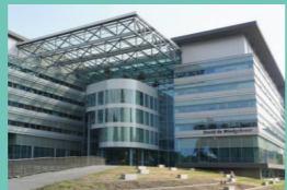
David de Wied building (DDW)