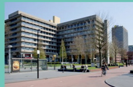
Hugo R. Kruyt building (KRUYT)