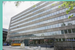
Buys Ballot building (BBG)