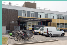
Caroline Bleeker building (CBB)