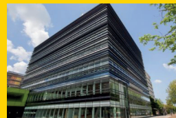
Victor. J. Koningsberger building (KBG)

These are the Faculty of Science's buildings, but you might have classes anywhere on campus > students.uu.nl/en/contact/buildings