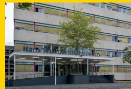
Hans Freudenthal building (HFG)