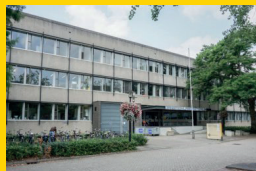
Leonard S. Ornstein building (OL)