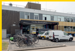
Caroline Bleeker building (CBG)