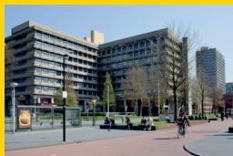
Hugo R. Kruyt building (KRUYT)