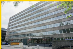
Buys Ballot building (BBG)