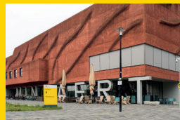
Minnaert building (MINN)