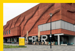
Minnaert building (MINN)