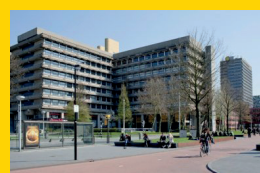
Hugo R. Kruyt building (KRUYT)