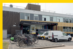
Caroline Bleeker building (CBG)