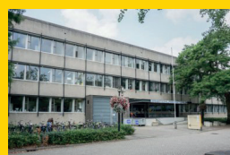
Leonard S. Ornstein building (OL)