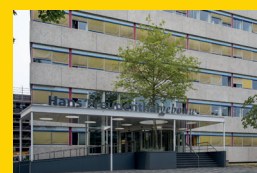
Hans Freudenthal building (HFG)