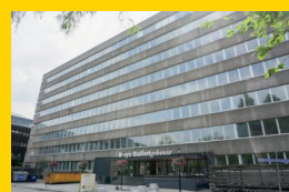
Buys Ballot building (BBG)